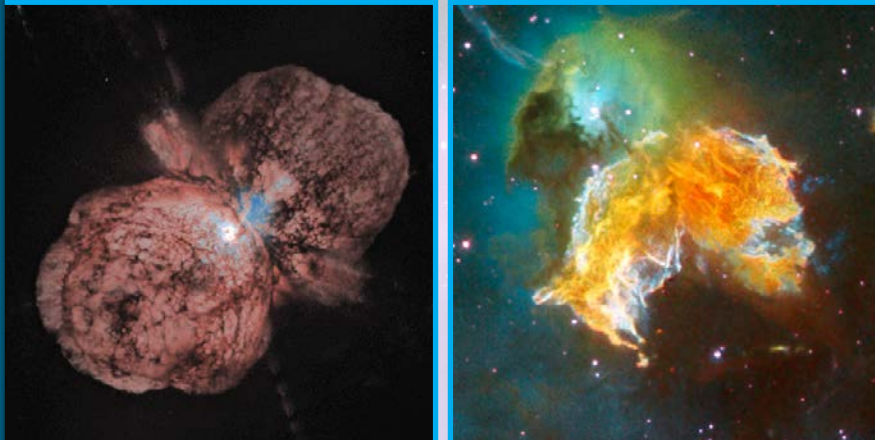
Supernovas are so bright that scientists can spot them in galaxies millions of light-years from Earth.

A star releases energy through nuclear fusion. The star burns up hydrogen as a hot bonfire burns up a log. When the fuel runs out, the star's core suddenly collapses due to gravity. Its outer shell explodes in a fiery blast. This explosion is called a supernova . It's one of the most powerful explosions in the universe. A supernova releases more energy in one week than the Sun releases over its entire life!